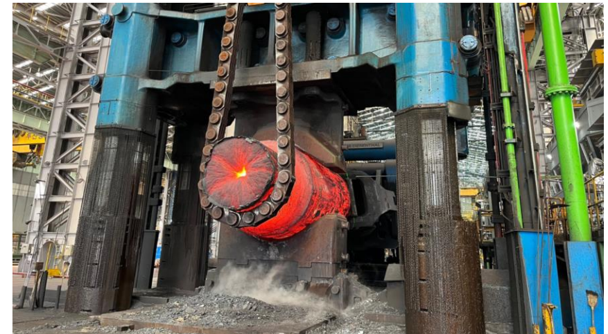
Forging production for 6 Upper Reactor Pressure Vessels in progress and long lead items ordered (Doosan Enerbility)