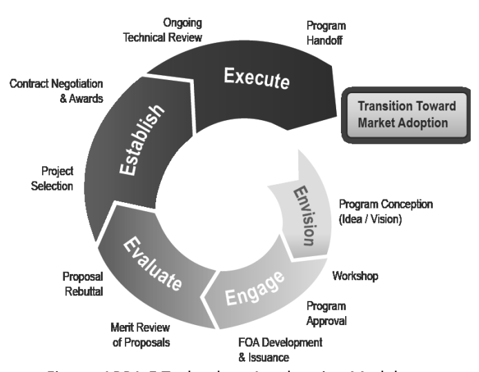
Figure: ARPA-E Technology Acceleration Model

ARPA-E programs are created through a technology acceleration model that begins with a thorough vetting of a particular technology concept. Figure 2 shows the full life cycle of an ARPA-E program (Envision, Engage, Evaluate, Establish, and Execute) from program conception through transition toward market adoption (See Figure).