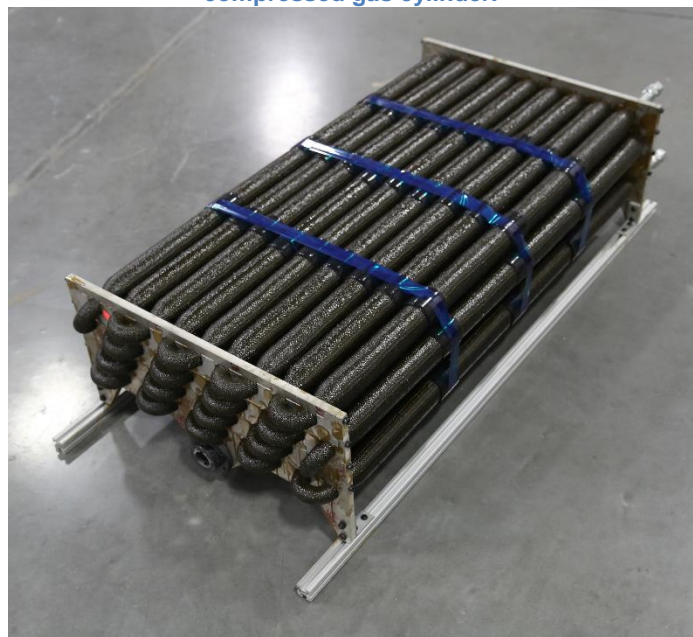
Figure 1. Otherlab's compressed natural gas tank is a folded tube that conforms to the available space, allowing more efficient fuel storage in irregularly-shaped spaces than in a traditional compressed gas cylinder.

The conformable tank is well-suited to highly automated continuous manufacturing processes, whereas traditional carbon fiber composite cylinders are wound one at a time. Otherlab's