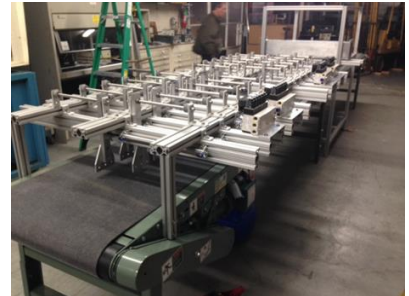
Figure 2. (top) 30 kV, 36" wide X-ray source. (bottom) The UHV pilot scale aluminum alloy sorting system.