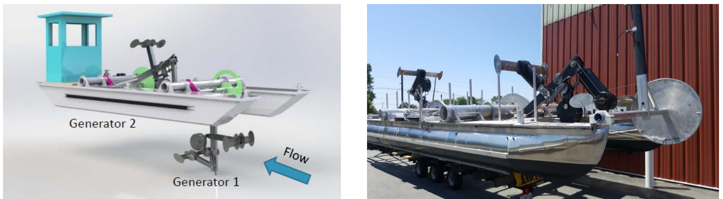
Figure 2: Brown University's 2kW prototype cyber-physical oscillating hydrofoil marine hydrokinetic energy generation system. (Left) Model of the floating platform design showing the generators, each with tandem hydrofoils, and their ability to pivot into and out of the water. (Right) Photograph of the fabricated device, before its multi-week deployment at the Massachusetts Maritime Academy.

A second prototype test was conducted to test the interactions between two devices, the second downstream of the first. The pair of tandem foils illustrated in Figure 2 achieved the 2kW design power rating. The power generated by the downstream set of foils was 60-80% of that generated by the leading foils, as compared to rotary turbines where the trailing turbine generates at most 40% when placed 6 diameters away. Deployment used a low-cost tugboat that brought the floating platform into position and lowered the foils into the water. Seamless transition between operating mode (hydrofoils pivoted in) and maintenance mode (hydrofoils pivoted out) was demonstrated.